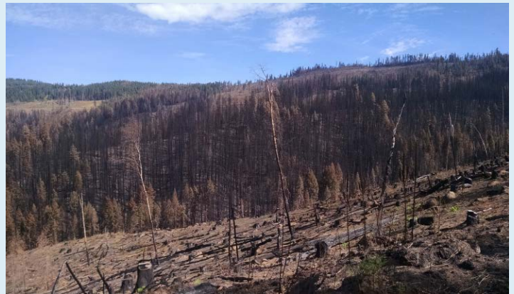
A few charred tree trunks are all that remains after a section of forest was burned by the Motorway Complex Fire near Syringa and Lowell in 2015.

The combination of more fires and drier conditions may expand deserts and otherwise change the landscape in southern Idaho. Many plants and animals living in arid lands are already near the limits of what they can tolerate. Higher temperatures and a drier climate would generally extend the geographic range of the Great Basin desert. In some cases, native vegetation may persist and delay or prevent expansion of the desert. In other cases, fires or livestock grazing may accelerate the conversion of grassland to desert in response to changing climate. For similar reasons, some forests may change to desert or grassland.